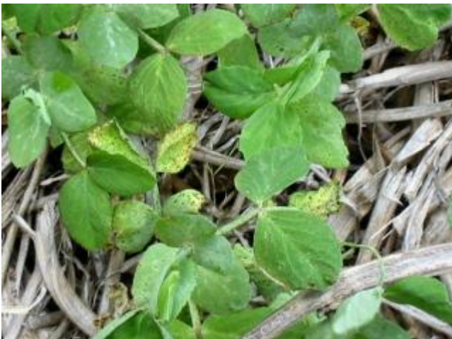
Field pea with blackspot.

Blackspot Manager is a model that predicts the maturity and release of spores that cause blackspot in field pea, using weather data from the nearest weather station. Advice is given on when it is safe to sow field pea.