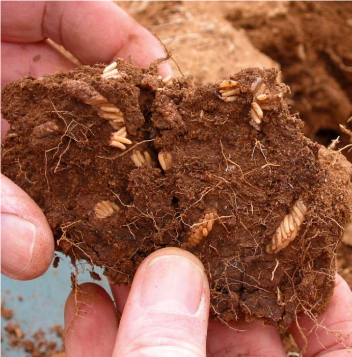
Australian plague locust eggs in a clump of soil aggregated as an egg bed.