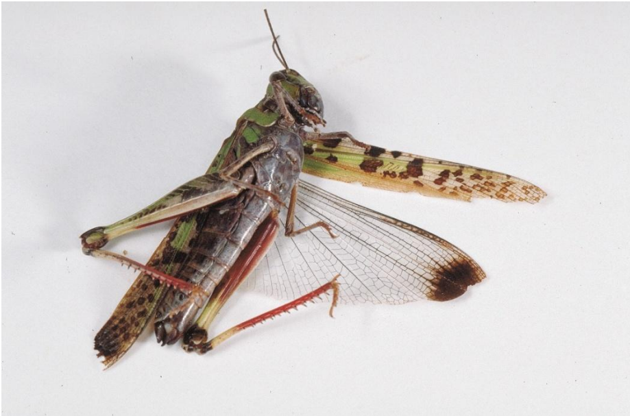
An adult Australian Plague Locust.

The APL ( Chortoicetes terminifera ) is native to Australia and has an X-shaped marking behind the head. In nymphs, this marking may appear faint but becomes more distinct as they mature. Adult APLs are distinguished from all other grasshopper or locust species by a dark spot on an otherwise clear hind wing, which appears as an elongated black smudge. They also have red tibiae or hindleg shanks.