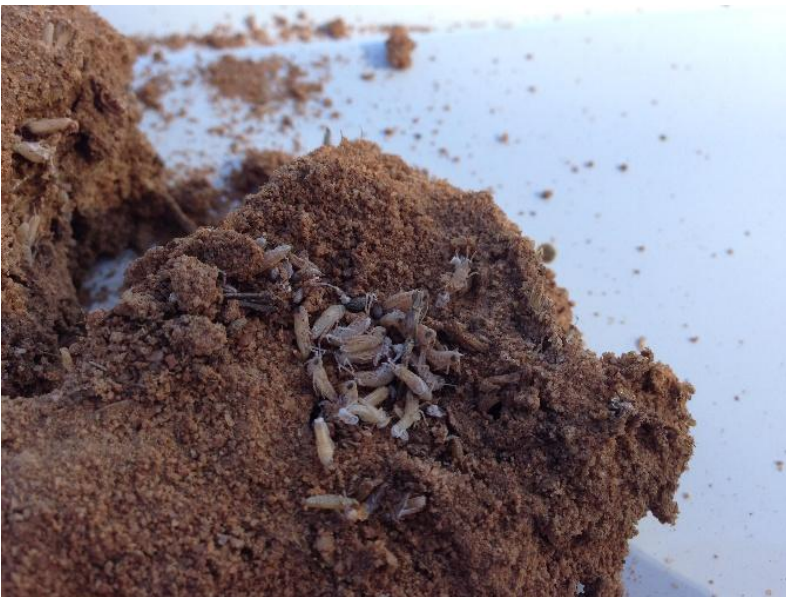
Australian plague locusts nymphs emerging from their eggs.

Growers observing APL activity now are encouraged to record the location and revisit these areas in spring to check for any hatching APL.