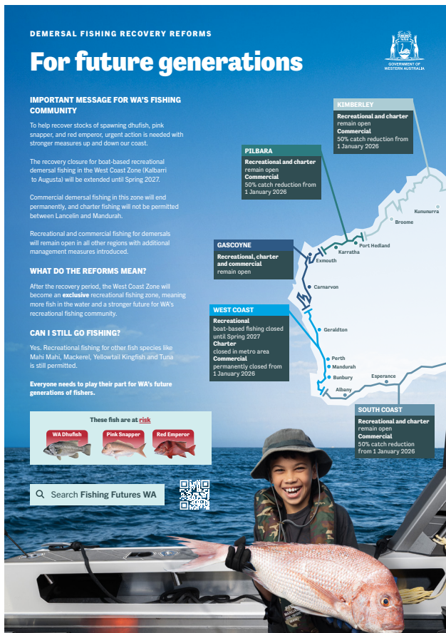
A3 Poster 1